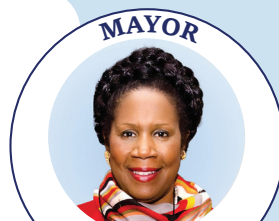
Sheila Jackson Lee

Two Democrats made it to the Run-off for Mayor!